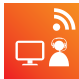
Communication & Management